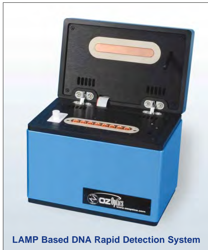
LAMP Based DNA Rapid Detection System

The LAMPPY™ system uses an array of high powered LEDs, photodiodes and filters for real-time quantitative detection. Samples to be tested are first mixed with a solution of primers and enzymes as well as an intercalating dye, then dispensed in standard 0.1 mL PCR tubes with flat caps, commonly known as low-profile PCR tubes. Acceptable sample volumes can be between 5 to 125 µL (10–30 µL recommended). OZ Optics does not provide the solutions/kits. Instead, we collaborate with companies who make these solutions/kits for specific applications and pathogens. The instrument can work with many different solution kits for different pathogens. For that reason we consider it to be a universal DNA/RNA detection system.