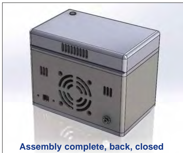
Assembly complete, back, closed

The standard system utilizes an excitation diode/filter combination emitting at 465–488 nm and a filter/detector combination for 500 nm to 590 nm light. This setup is compatible with many popular fluorescent dyes, including SYTO 9, SYBR Green and EvaGreen dyes. Solution kits using these or similar dyes can work with our instrument as-is. However, if the user wants to work with different dyes that utilize different wavelengths, OZ can provide sample blocks with different diode and filter combinations. The sample blocks can be exchanged by the user, making the instrument extremely versatile.